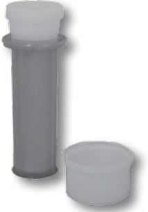
Reusable Container inside Protective Container System™ with Locking, Tamper-Evident Cap.