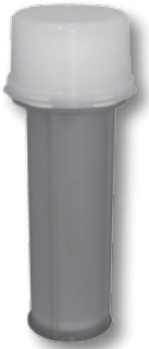
With PCS™ You KNOW Your Slush is Sterile During Use.